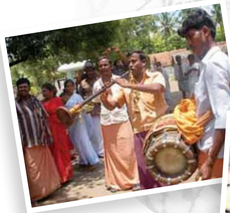
A local tribal village in South India welcomes the UB delegation.

“Sustainable communities’ means ones that can build capacity to be self-sufficient. That’s the overall goal in our research.”