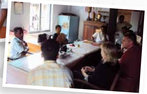
Faculty meet with grade school administrators and teachers at a school where the 2005 tsunami hit.