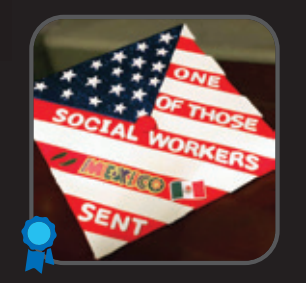
BEST REPRESENTATION OF THE FIELD Hector Chaidez-Raucho

ne thing that makes us strong as social workers is our adaptability, our understanding of how to handle different—and difficult situations. Our 2019-20 graduation ceremony, while conducted remotely, via media including live and video streams and online photo sharing, still captured the hope and determination that we—and our graduates—embody. We congratulate each of these new alumni.