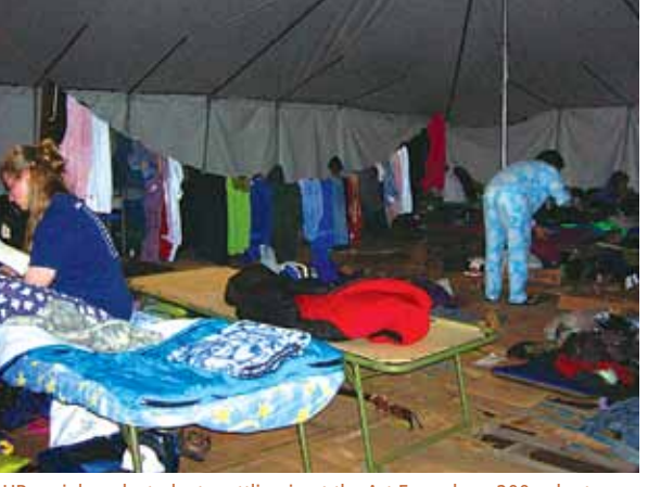
UB social work students settling in at the Art Egg where 200 volunteers slept and ate during their stay in New Orleans.

work materials for the day. Every morning we dressed ourselves in Tyvek suits, goggles, rubber boots, gloves, and bandannas. Each student had to protect his or her body and clothing because of the mold, termites and