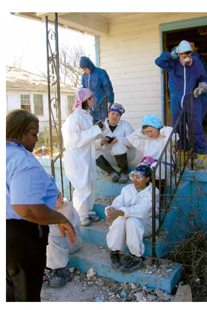
Some of the UB social work team and fellow volunteers take a break in their protective Tyvek suits. Their work was always hot and often heartbreaking.