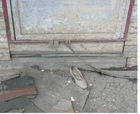
Images such as this spoke to the tragedy in New Orleans in a thousand small ways.

to study sociology with a focus on substance abuse. We learned that we all shared similar educational interests, which made our conversations very enlightening. Also, before we left New Orleans, all of us who worked on the home were invited to dinner with these two women to show us their appreciation for cleaning their mother's home—the kind of hospitality that is a part of Southern culture.